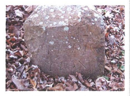
Southwest No. 9 marker is in Benjamin Banneker Park and was designated a National Historic Landmark in 1980. The Falls Church Chapter dedicated it in 1916 and rededicated it in 1989. You can read "Virginia" on one side of the stone and part of the lettering for "Jurisdiction of the United States" on the other.

"Without their efforts, there is no doubt these stones would have never survived," Powers says. Today, almost 100 years later, 34 fences continue to protect the stones, and the DAR is still actively involved in their maintenance. In fact, the D.C. DAR just commemorated the 220th anniversary of the