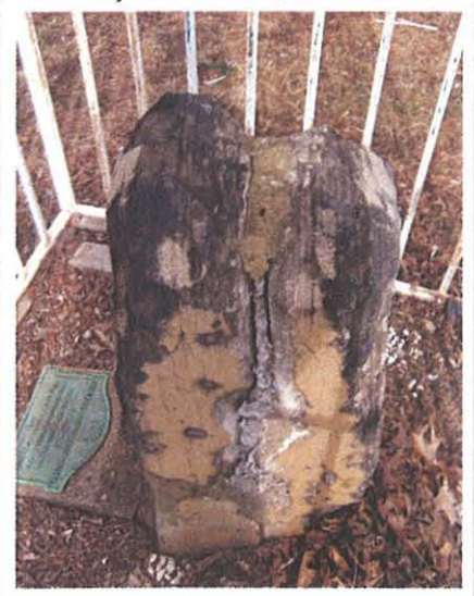
Southwest No. 6 boundary marker sits in a median of a road in Northern Virginia. It was dedicated in 1916 and rededicated in 1965 by the Fairfax County Chapter, Vienna, Va. The stone is original, but it has been repositioned a few times. It was once hit by a car and cemented back together, according to Mark Kennedy at www.boundarystones.org.

Forty boundary stones were needed to outline the city—a cornerstone for each compass direction and nine stones placed at one-mile intervals along each side. The stones were quarried out of sandstone from Aquia Creek, a subsidiary of the Potomac River that also became the source for the original stones of the White House and the U.S. Capitol. Each boundary marker was 4 feet tall and 12