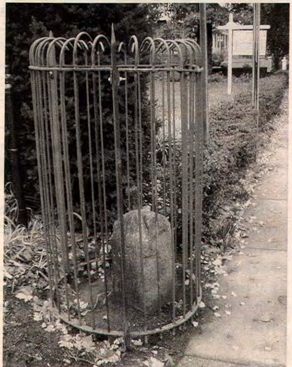
The Boundary Stone today, all restored.